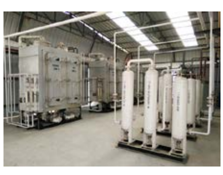
90 Nm3/hr Hydrogen Generation Plant Gold Plus Glass Industry, Roorkee, India